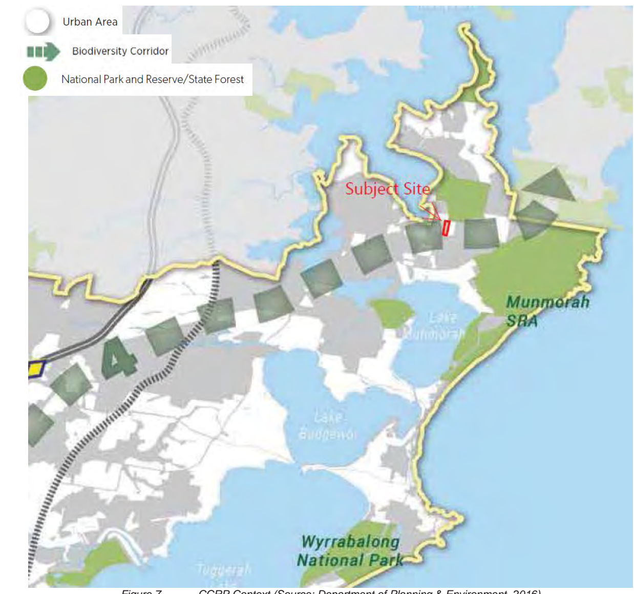
Figure 7 CCRP Context

An assessment of the request to amend WLEP 2013 against the relevant directions of the CCRP has been undertaken as attached (Attachment 2). The proposal is considered to be consistent with the relevant directions, in particular, those relating to the provision of housing supply.