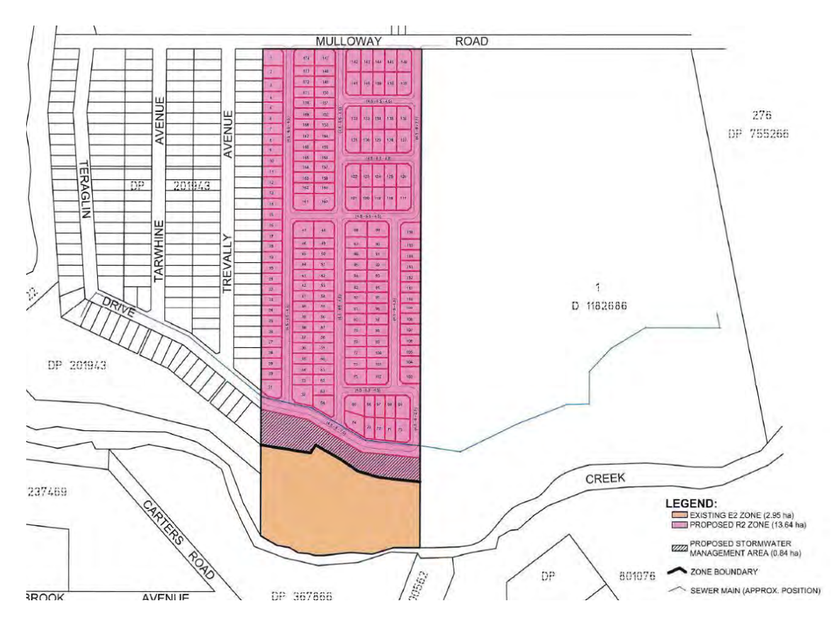
Figure 2 Indicative Concept Lot Layout Plan

The original concept plan submitted with the request proposes an indicative lot yield of 174 lots with the standard lot size ranging from 450m<sup>2</sup> - 580m<sup>2</sup> and corner allotments from 700-812m<sup>2</sup>.