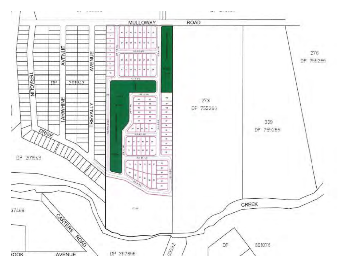
Figure 3 Indicative Concept Lot Layout (Incorporating Proposed Wildlife Corridor) Plan

The inclusion of the proposed wildlife corridor represents an improvement to the original concept, however the location, extent and functionality of the proposed corridor requires further investigations to validate its appropriateness. This investigation can occur post Gateway Determination.