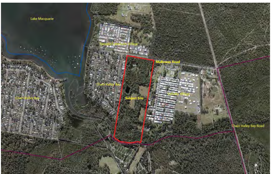
Figure 1 Locality Context

The site is located east of the low density residential settlement of Chain Valley Bay which comprises predominantly single dwellings. The site is located in close proximity to two Manufactured Home Estates (MHEs), being Teraglin Lakeside Village MHE to the north-west (of Mulloway Road) and Valhalla Village located directly adjacent to the subject site on the eastern site boundary. These two MHEs indicate the changing nature of Chain Valley Bay from its historic development as an agricultural area, including market gardens and grazing to an urban release area that provides varied housing opportunities in the Central Coast Region.